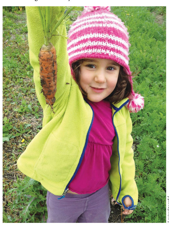
Our Smart & Caring Community Fund is a nimble, flexible and responsive fund, so you can see the impact in our community quickly.