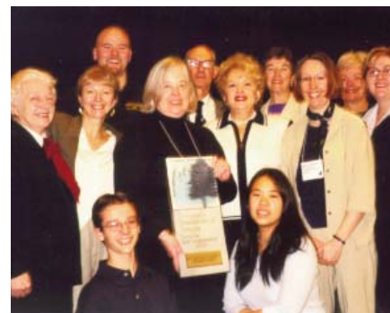
A proud moment for CFGK

munity Foundations of Canada Conference 2000, in Ottawa. The awards are given every two years to foundations in two categories: one with assets over $3 million and one with assets under $3 million. Kingston falls in the latter category.