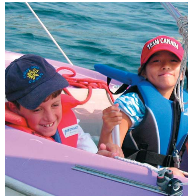
Keeping Dreams Afloat

Following up on the CFGK Fast Track grant with a Healthy Communities grant, our current challenge is to continue to develop the program for young people, especially those making the transition from the learn-to-sail to the racing program. This most recent grant will allow us to adapt the Martin 16 from single- to double-handed sailing and to install a spinnaker to increase speed and keep our competitive edge. The souped-up boat will be seen again next year on the Kingston waterfront.