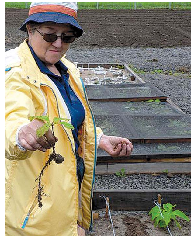
Seedlings on Lemoine Point

All participants left the tour with just a glimpse of the wide range of important environmental and conservation projects undertaken by over 60 groups and organizations in our area. For more information about environmental projects, groups, and how to support them, visit the Environmental Initiatives web page, www.cfgk.org/enviro or call 613.546.9696.