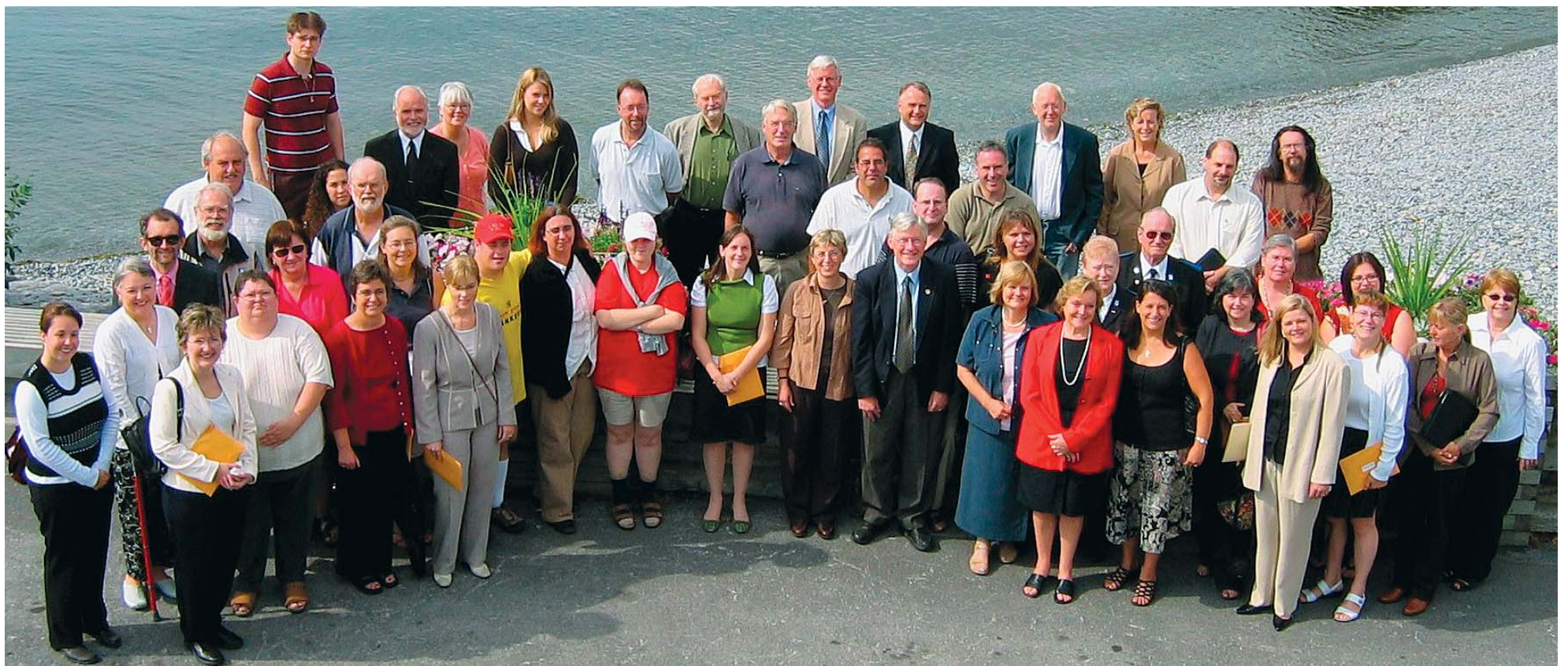
City of Kingston Healthy Community Fund Grant Recipients for 2006.

The trick for CFGK is to find a way to make the Vital Signs program doable for a community foundation such as CFGK, which is in the mid-size range. To this end, the Red Deer (Alberta) Community Foundation is testing the process this year and will publish their first report in 2007. With their help, CFGK could be on our way to adding an important part to its third role, being a catalyst for good in the greater Kingston community.