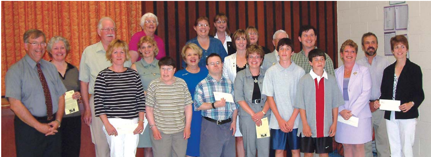
The Picton Gazette