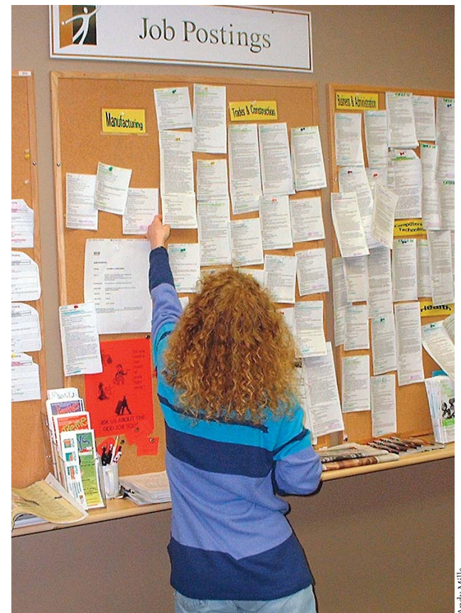
A future employee uses the job postings board at KEYS.

Thanks to all of the members involved in CFGK. Your support to communities throughout the Kingston area is much appreciated.